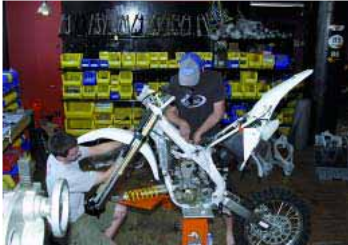
A Christini kit getting assembly-tested at the Philadelphia R&D facility. By this point, everyone at Christini is able to take apart a CRF and put it back together blindfolded and quite asleep. Soon we'll see the shop full of KTMs.

The much-anticipated Christini KTM AWD kit was debuted at the 2007 Indy Powersports Expo on a 400EXC. The 400EXC is now running and is currently undergoing initial testing, with plans in the works to have prototype KTM-based 250/300 two-strokes in the field for testing in early summer. Christini plans to enter at least one KTM in the 2007 World Enduro North American rounds. Production dates and a retail MSRP have not yet been set for the KTM, but a late summer, early fall release is likely. Initial interest is strong and Christini is currently accepting $500 refundable deposits on KTM kits.