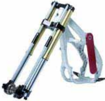
The heart of the Christini system: the modified frame and AWD front end, here for a Honda CRF250X. Below: The race bike stable awaiting maintenance.