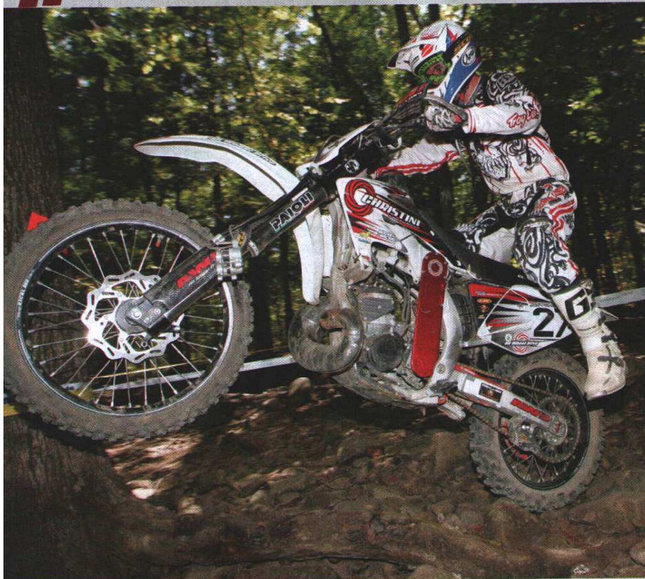
The drive chain is well-hidden for a unique look.