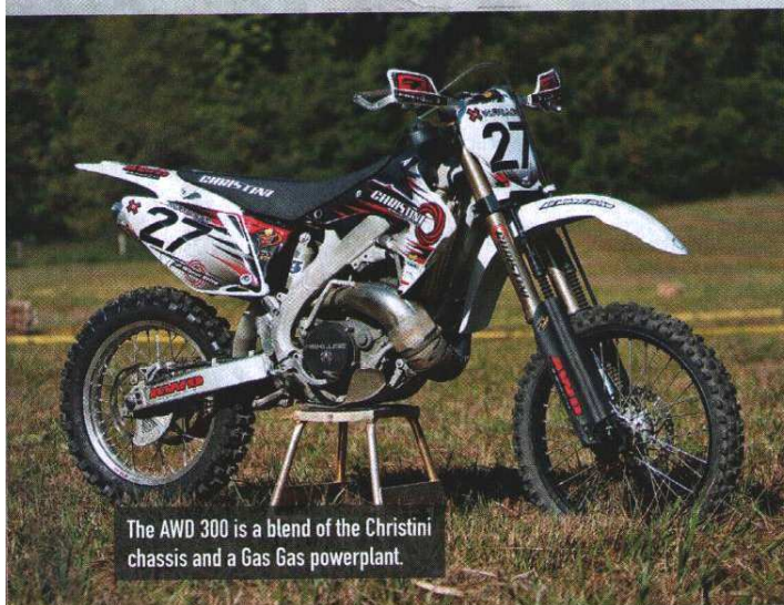
The AWD 300 is a blend of the Christini chassis and a Gas Gas powerplant.