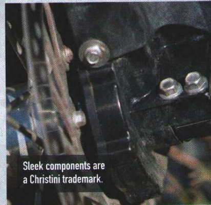
Sleek components are a Christini trademark.