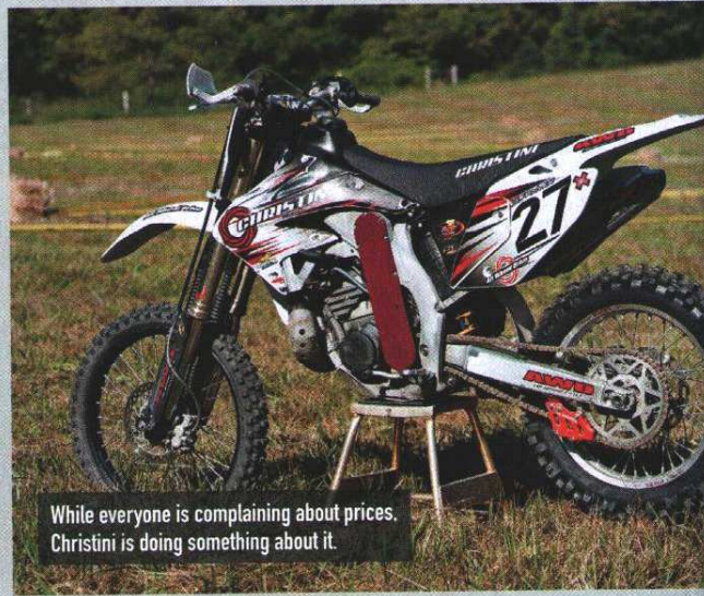
While everyone is complaining about prices, Christini is doing something about it.

Perhaps the coolest part of the AWD 300 is the price: $8,995 for the complete bike. Most riders are under the impression that a Christini costs an arm and a leg, but the reality is that riders can now get a hard enduro-ready all-wheel-drive 300 for less than the cost of a new KTM. The AWD 450 is even cheaper at an astonishing $6,895. For something this advanced, the complete package is great. As a race bike it's a sweet